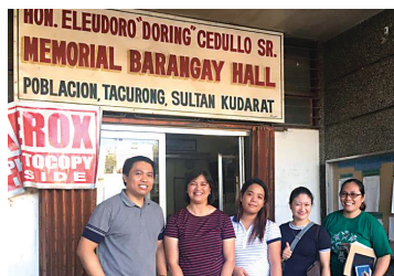
PAMET Officers in front of the meeting venue