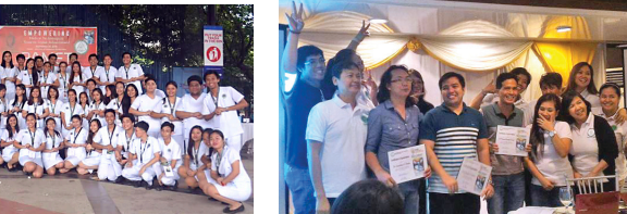
Inter Lab Quiz Show, Star Plaza Hotel