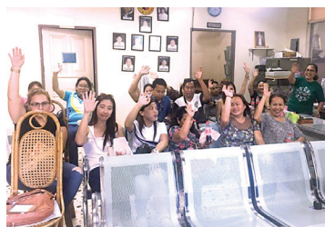
Meeting attendees voted for the motion to include Sultan Kudarat as part of PAMET SOCSARGEN.