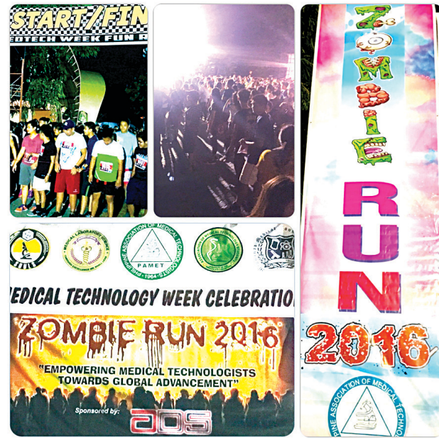
Medtech Week Funrun 2016 is Zombie Run. Students and professionals participate in the annual Medtech week opening run activity at the People's Park, Davao City on Sept. 18, 2016.