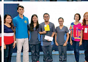
Winners of the 3rd Interlaboratory Quiz Show. Clockwise from top right: Team Davao Doctors Hospital (Champion), Team Metro Davao Medical and Research Center (1st runner up), Team Southern Philippines Medical Center (2nd runner-up).

In the same month of September, PAMET-Davao participated in the government-lead coastal clean-up in Sept. 17 more popularly called "Bayan ko, Linis Ko" program. PAMET Davao is assigned at a coastal area near Agdao. Clean-up was done along the shoreline, clogged canals and common community places.