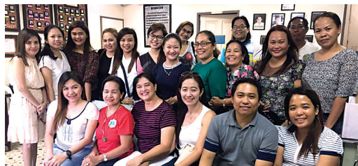
Sultan Kudarat RMTs pose with the PAMET Mindanao Regional Director and PAMET SOCSARGEN officers after the consultative meeting.