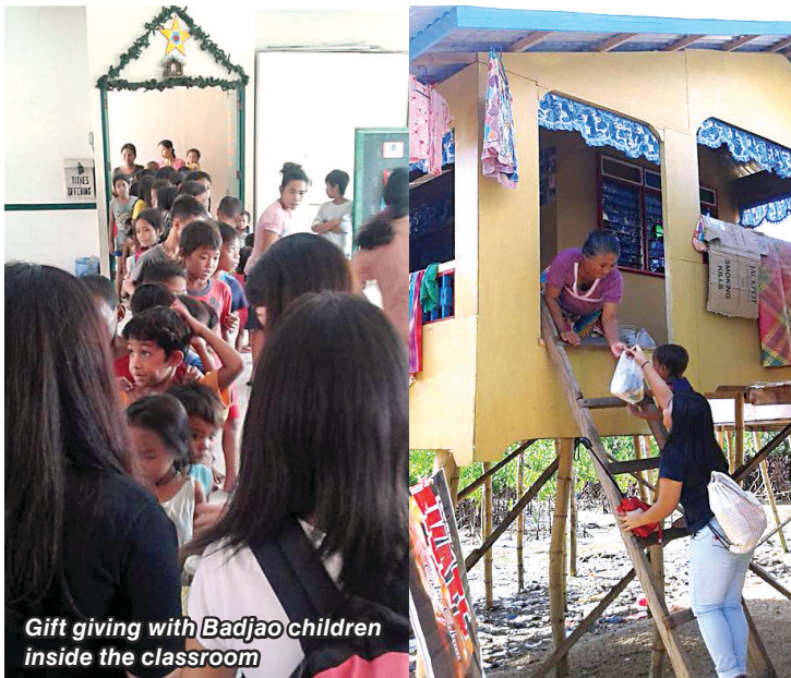
Gift giving with Badjao children inside the classroom

Gift giving with the Badjao families at Apo Beach Sta Cruz, Davao Del Sur. Including the childrens at the classroom situated in the area of the Badjao communities, December 12, 2016.