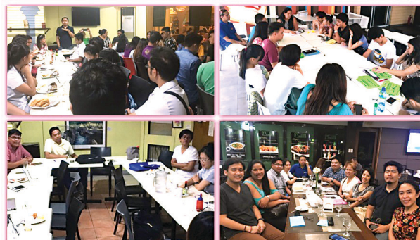
Clockwise from top left: Funrun subcommittee meeting, emergency funrun committee meeting due to recent bombing, Chapter officers regular meeting in September and October 2016.