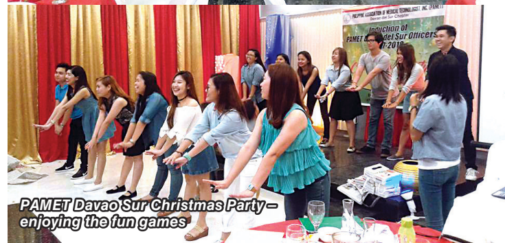
PAMET Davao Sur Christmas Party= enjoying the fun games