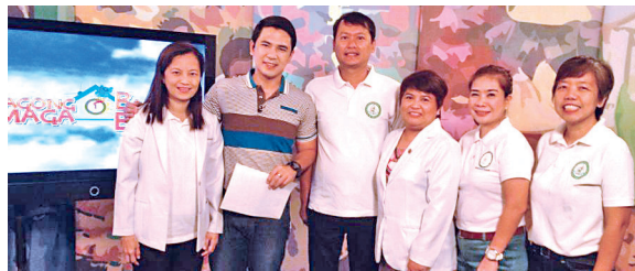
Pangasinan TV guesting at ABS-CBN MedTech Week Invitation