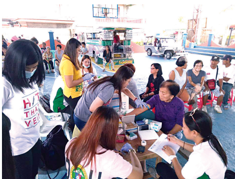
EMERGENCY NAKAR STATION HOSPITAL

Last August 11, 2016, the chapter organized a medical mission for the members of the Armed Forces of the Philippines (AFP) Southern Luzon Command (SOLCOM) based in Camp Nakar in Lucena City. Free clinical chemistry determination (glucose, cholesterol, triglycerides, blood urea nitrogen, uric acid), complete blood count and urinalysis were provided to the beneficiaries. The said medical mission was made possible through the generous help of Pioneer Clinical Laboratory and Medical Clinic, VG & GE Trading Diagnostics and LPU-Batangas College of Allied Medical Professions.