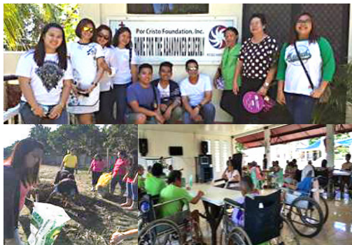
"Por Cristo" Sharing of Blessings - "Clean Up Drive @ the Coast," Buenavista, September 2016

3rd Quarter Regional Coordinating Committee Meeting, September 8, 2016 Hotel Luciana, Butuan City