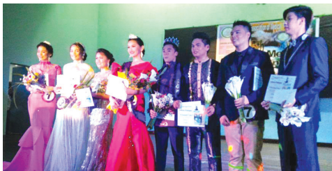
Mr & Ms PAMET Pangasinan