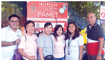
Mobile Blood Donation